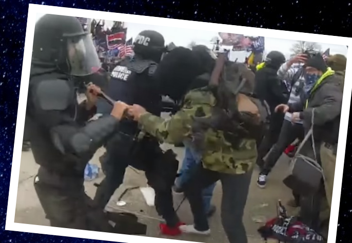
Intense political factionalism and mounting social and economic issues led to a steady decline of the United States throughout the 2020's and 2030's.

While most countries assumed another conflict was imminent – prompting widespread militarization – such a war failed to materialize. Instead, governments found themselves battling rising ocean levels, ever-expanding wildfires and virulent diseases. Some areas cracked with drought while others washed away with relentless floods. Dozens of countries saw untold numbers of "climate refugees" pack up and leave, while other regions became their involuntary destinations. Trillions of dollars' worth of military equipment quickly found itself being repurposed to fight against the forces of nature itself.