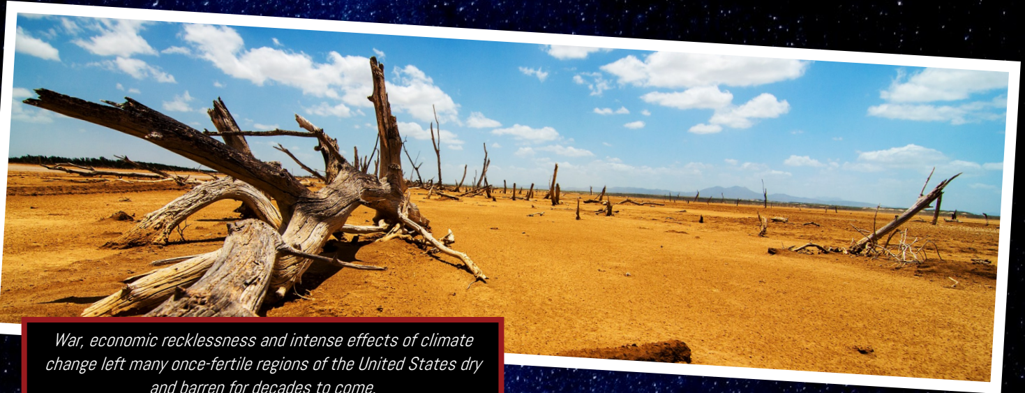
War, economic recklessness and intense effects of climate change left many once-fertile regions of the United States dry and barren for decades to come.

major cities in ashes. The once-robust American economy collapsed entirely by the 2030's, pre-empted by decades of intense corporate recklessness, the northward swing of the American breadbasket and the loss of significant miles of coastline and coastal cities.