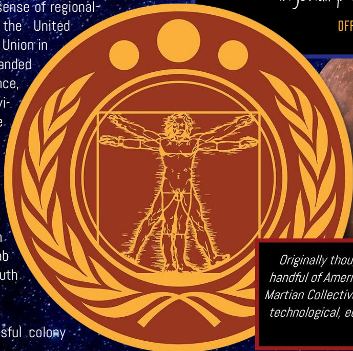
"Ingenuity. Sustainability. Humanity." OFFICIAL MOTTO, Martian Collective

With the goal of redefining humanity through science and innovation, the Collective drew together the top minds in everything from bioscience to engineering. By the start of the 2040's, many international leaders began to lament a global "brain drain" while offering lavish incentives to keep the intellectual elite firmly on Earth. By 2050, the population on Mars had reached over 12,000 throughout six major settlements. Hoping to counter and profit from Martian successes, the first lunar supply depot – Chandra Station – was established by a joint Euro-Indian effort in 2041.