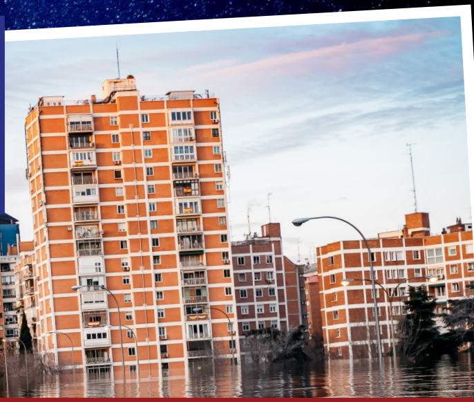
Cities like Milan, Spain (above) found themselves under intense floodwaters, while some regions — like the American state of Florida — were washed away almost entirely.